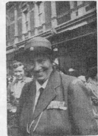
LADY B.P. IN AUSTRALIA