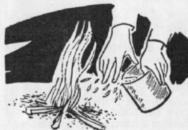
Scouts are taught to drown a fire before they bury it.

671-673 SYDNEY ROAD, BRUNSWICK. FW 6345-FW 5821.