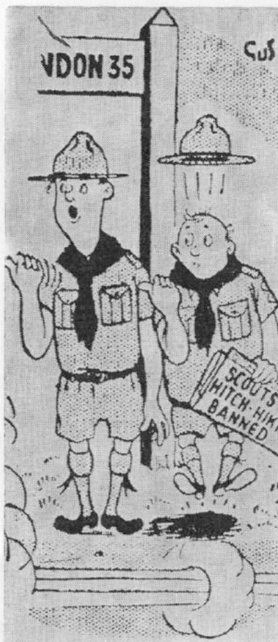
"Good job it didn't stop — That was the Scout Master!"